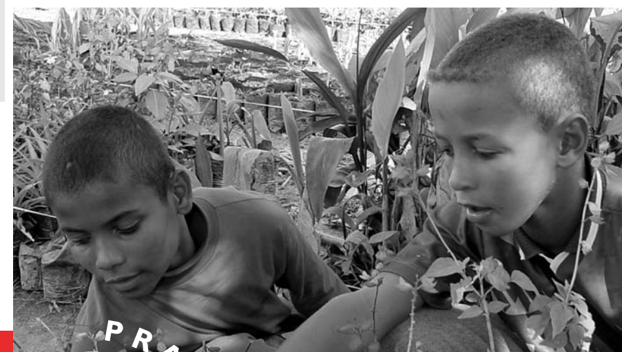
Cultivating flowers for the eco fayre