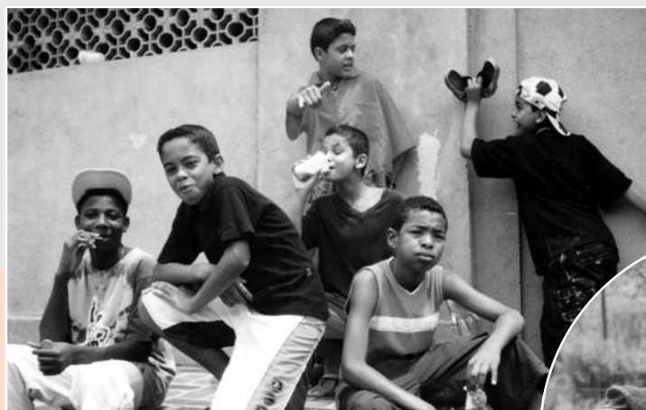
Ready to play football