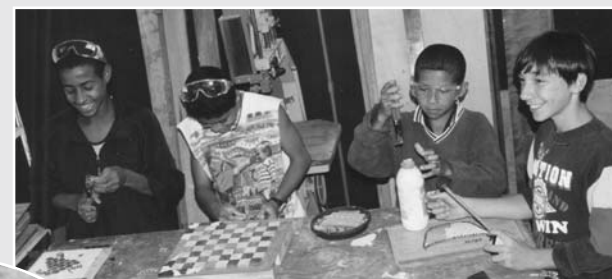
Making mosaic in the craft workshop

When we were in Recife I felt God speaking through I Chronicles 22:11-16, that He will provide all the resources and people - but prayer is what brings God's will on earth from heaven!