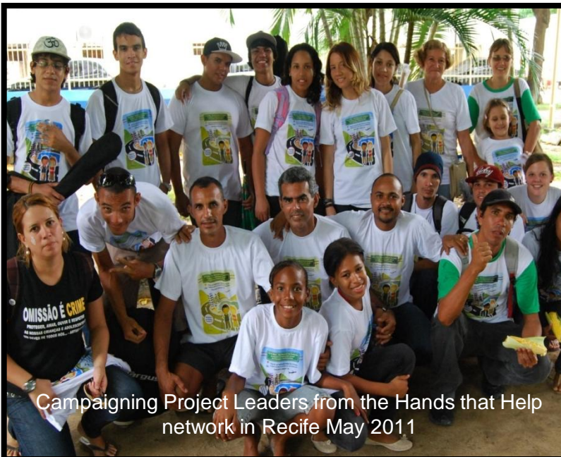
Campaigning Project Leaders from the Hands that Help network in Recife May 2011

The HANDS THAT HELP Recife Network of 26 projects was founded in 2008 by 180° Alliance, and is now managed by Happy Child. It's vision is to actively support and invest in projects working with vulnerable children in Recife's metropolitan region. It also lobbies and works closely with children's policy makers and local government. Three year funding for this Network was secured through Happy Child's partnership with 180 Alliance here in the UK. HANDS THAT HELP's participation in the national protest March on May 18 th really brought the vulnerability of these children to the attention of the Brazilian public. Since 2008 HANDS THAT HELP have been capacity building and training in the area of family reintegration, street work and leadership.