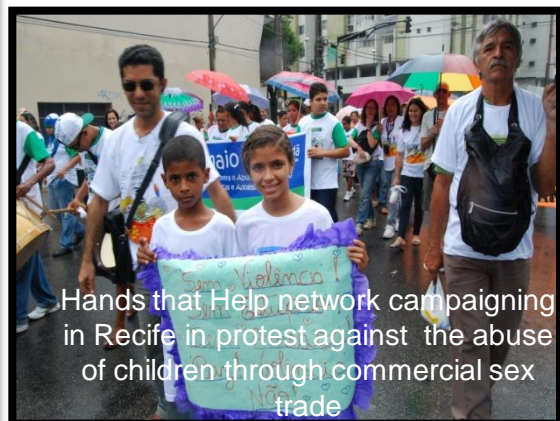
Hands that Help network campaigning in Recife in protest against the abuse of children through commercial sex trade