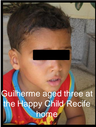
Guilherme aged three at the Happy Child Recife home