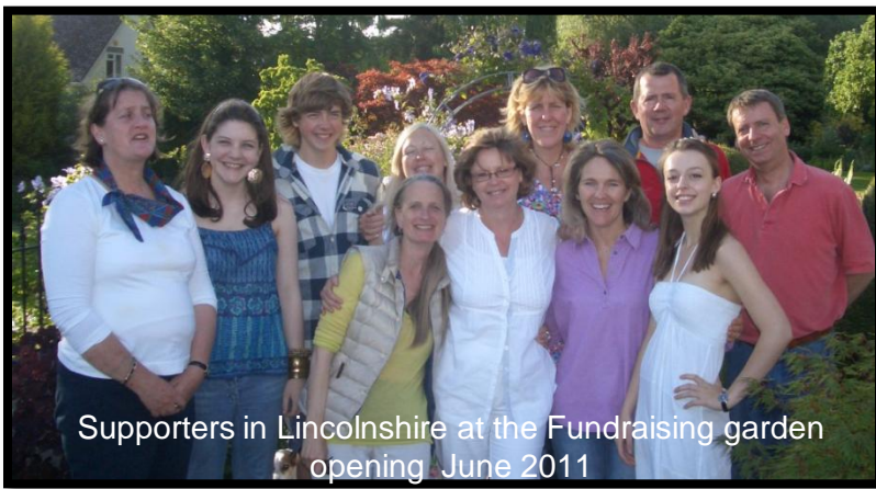
Supporters in Lincolnshire at the Fundraising garden opening June 2011