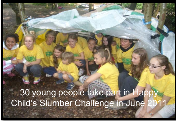
30 young people take part in Happy Child's Slumber Challenge in June 2011